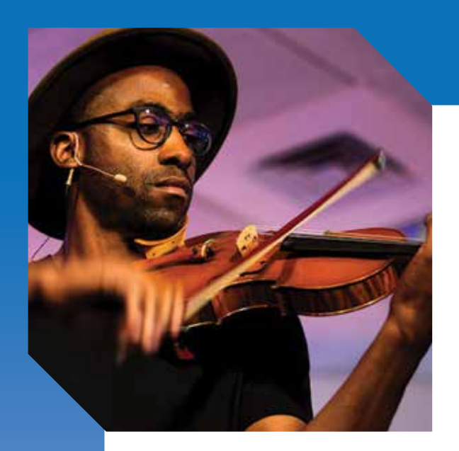
RIMS AWARDS AND RECOGNITION LUNCHEON MONDAY, MAY 4